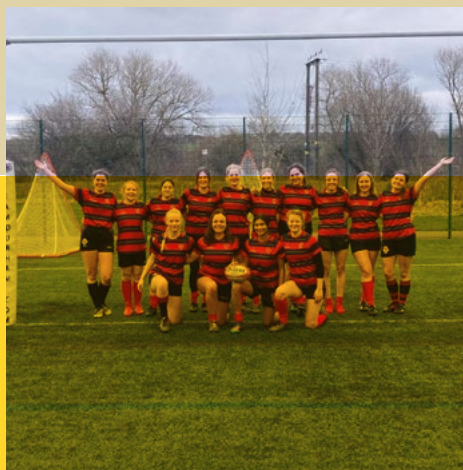
Below: The Women's Rugby Team.