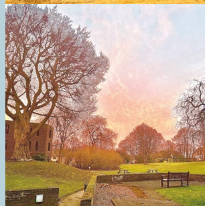
Above: The winning entry from our photography competition.