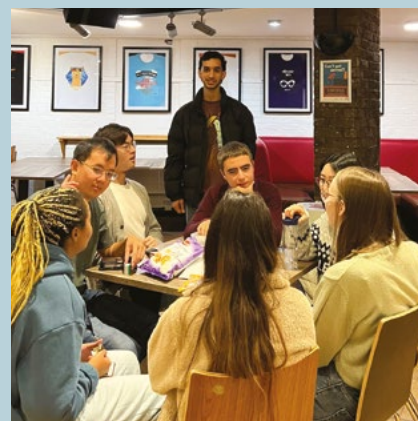
Above and centre: Participants at the Language Café.