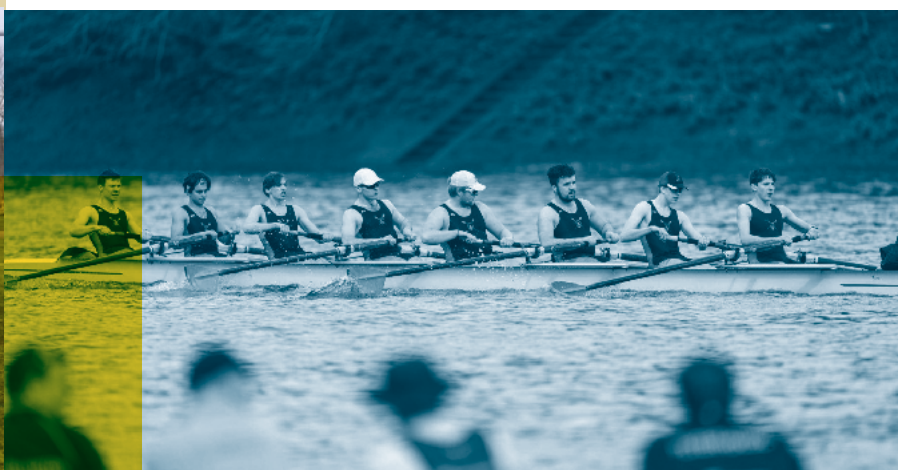
Below: Trevelyan College Boat Club (TCBC).