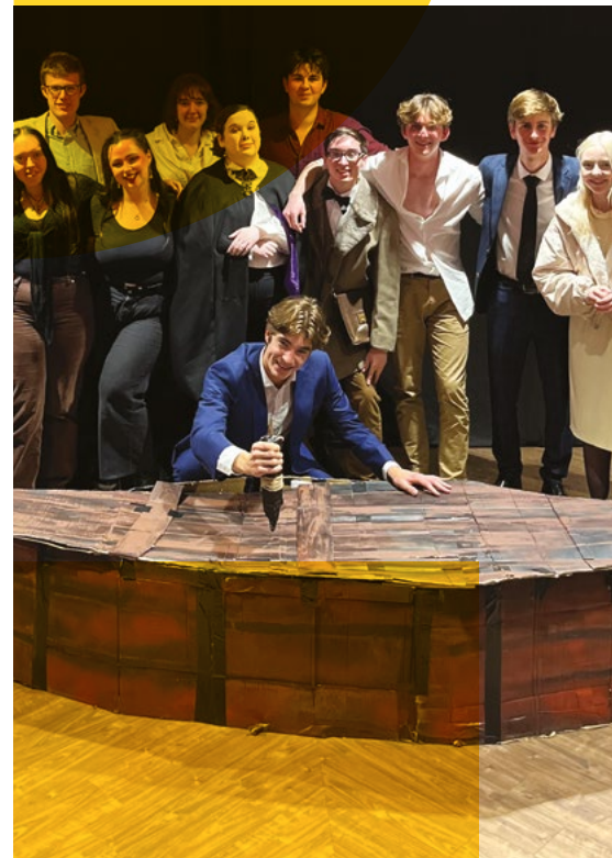
Above: Sixth Side Theatre.