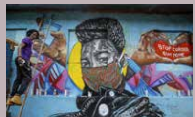
Street art and public health messaging in Mathare informal settlement, Nairobi, Kenya

With governments around the world regulating mask-wearing in public spaces to prevent contagion, the COVID-19 outbreak has had unexpected consequences, including face masks becoming a now-iconic image of the global crisis. They have become simultaneously valuable commodities, fashion items and, in the case of political leaders who have refused to wear them, a focus for debates about 'toxic mask-ularity'. In cities around the world, as public spaces were closed down, graffiti artists, street artists and muralists began to take over these spaces and create images of mask-wearing, using their artworks to express public health information, support of and dissent towards governments, and hope and solidarity at a time of fear and uncertainty. The project demonstrates that through their use of concrete and virtual spaces, street artists in both the UK and Eastern African countries are in a unique position to raise awareness of the pandemic, and to inspire debate and dialogue about issues of fear and stigma relating to disease. It highlights the role of street art in community building, resilience and recovery during the pandemic. It also demonstrates how geographers can play an important role in creating a better understanding of what face masks mean to people in different places and what challenges there are relating to people's willingness to wear them during the COVID-19 pandemic.