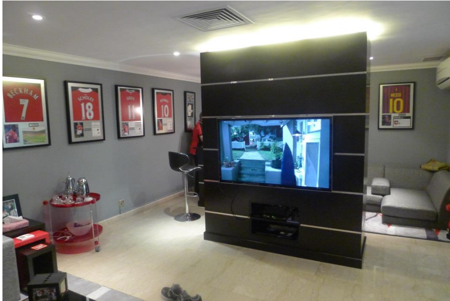
Figure 7. Twenty-year-old Mishal Jaber al-Sabah’s Diwaniyya (Photograph taken on 15/4/2013)