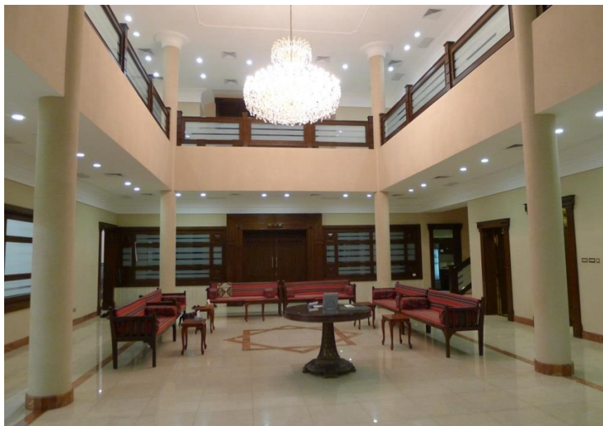
Figure 6. The Roumi Diwaniyya : A Standalone Diwaniyya (Photograph taken on 28/05/2014)