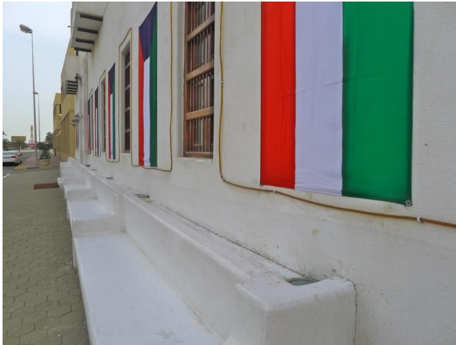
Figure 1. The Unused Datchas In Contemporary Kuwait (Photograph taken on 16/2/2013)

countries for business purposes. 25 As such, a case study of a small built environment manifesting patterns of social interactions is best exemplified by the diwaniyya .