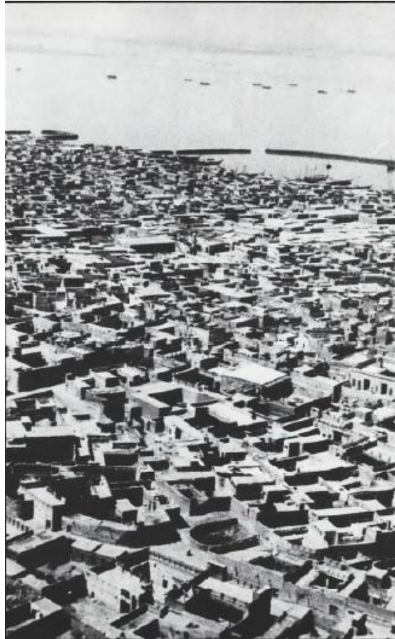
Figure 3. Pre-oil Kuwait Town