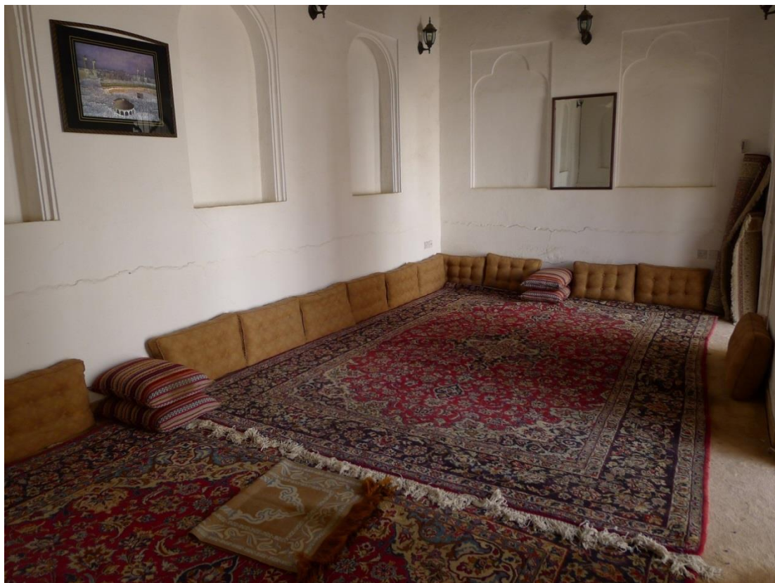
Figure 2. The Traditional Roudhan Diwaniyya : A Remnant Of Kuwait's Past (Photograph taken on 5/6/2014)