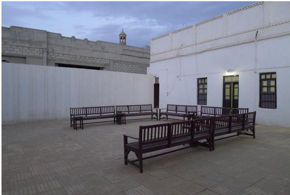
Figure 4. The A'soussi Family's Courtyard House (Photograph taken on 25/5/2014)