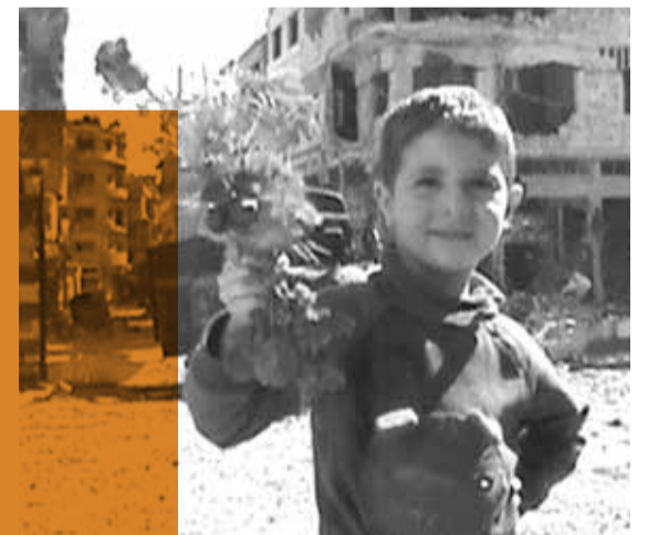
Left: Once Upon a Time Proletarian. Dir. Xiaolu Guo.