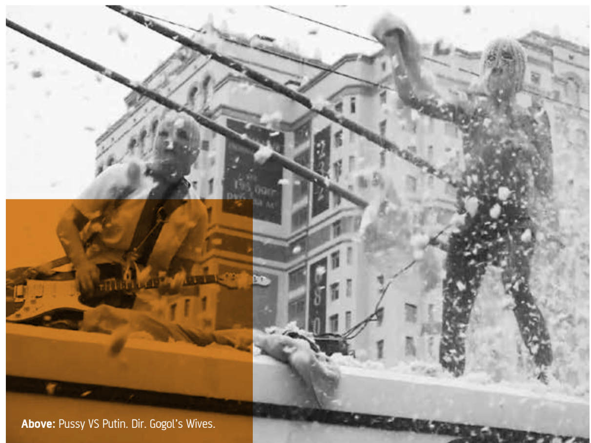
Above: Pussy VS Putin. Dir. Gogol's Wives.

When: Friday 6th October 20:30 How long: 1hr 46 mins Details: Dir. Harun Farocki & Andrei Ujica. Germany & Romania 1992 Language: In English, German & Romanian with English subtitles