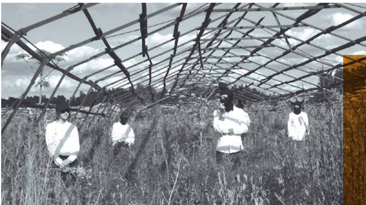
Left: Chto Delat? The New Deadline #17 Summer School of Orientation in Zapatism