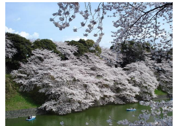
Top: Cherry blossom flower in full bloom.